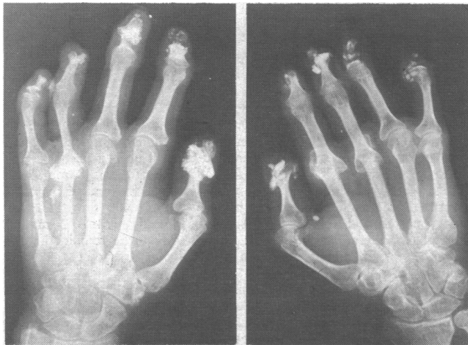
FIG. 3—X-ray picture of hands in November 1970 after treatment with probenecid. Dissolution of deposits, fast at first, had been maintained at a slower rate for 3 years.

urate during the whole of her follow-up are shown in Fig. 4. During that time there was no change in her general physical condition, which remained good. She was greatly heartened by the improved mobility and appearance of her fingers.