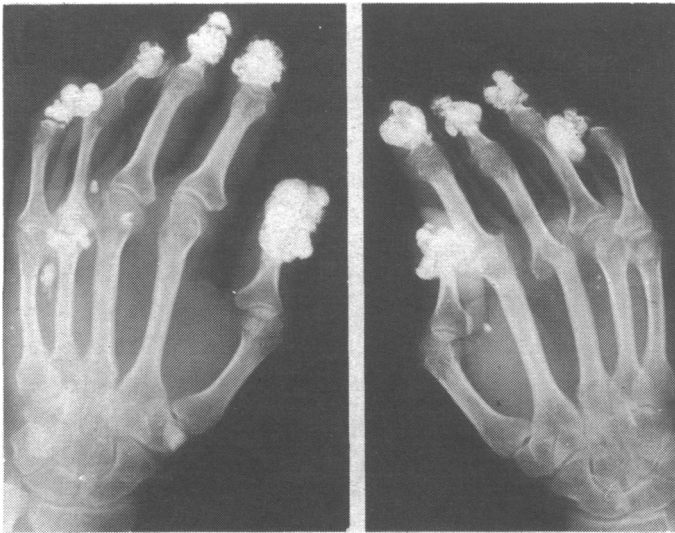
FIG. 2—X-ray picture of hands in January 1967 at end of treatment with EDTA for 8 months. No change was seen in calcific deposits during this period.

radiological picture, however, did not improve (Fig. 2). In January 1967 she was started instead on probenecid in gradually increasing doses. She later steadily and greatly improved (Fig. 3). Studies of renal phosphorus excretion by the technique of Stamp and Stacey (1970) after treatment with probenecid for two years showed a completely normal theoretical renal phosphorus threshold of 3.6 mg/100 ml, glomerular filtration rate 102 ml/min, and TmP 4.5 mg/min 1.73 m 2 . Changes in plasma calcium, phosphorus, and