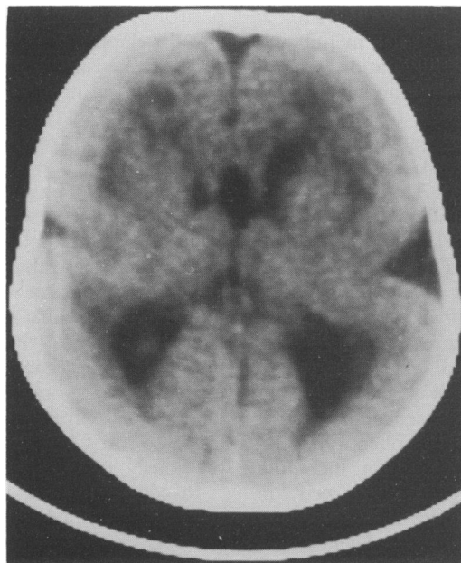
Figure 2 Computed tomogram showing a smooth cortex with absence of normal gyral pattern (lissencephaly). The lateral ventricles are widely separated with the third ventricle reaching up in between them suggesting agenesis or hypoplasia of the corpus callosum.

age was just below the third centile. She developed a divergent squint but examination of the eyes, including the corneas and funduscopy, was normal. Her development remained static, compatible with that of a floppy newborn baby. Her convulsions started at 15 weeks of age and progressed with increasing frequency in spite of treatment with different anticonvulsants. She developed cafe au lait spots at 6 months. At 8 months her fits became intractable, and she died when she was 9 months old.