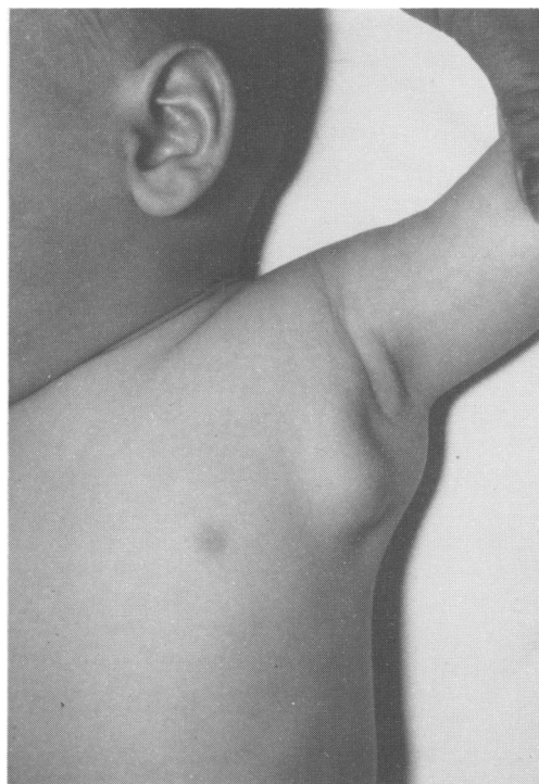
Figure 2 Lymphadenitis 10 weeks after vaccination.

In these infants the suppurative lymph nodes were totally removed surgically and showed caseous necrosis after incision. The excised necrotic tissue was sent to the Institute for