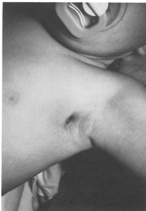
Figure 4 Lymphadenitis 13 weeks after vaccination, with spontaneous perforation.