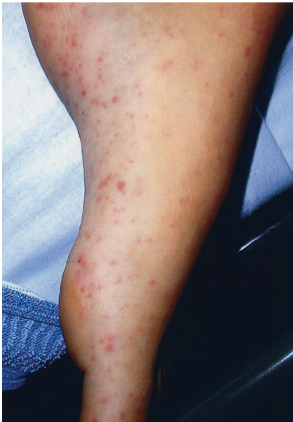
FIG. 2. Petechial and purpuric lesions on the foot of a rat bite fever patient.

gia is the most persistent finding of rat bite fever, lasting several years in some patients.