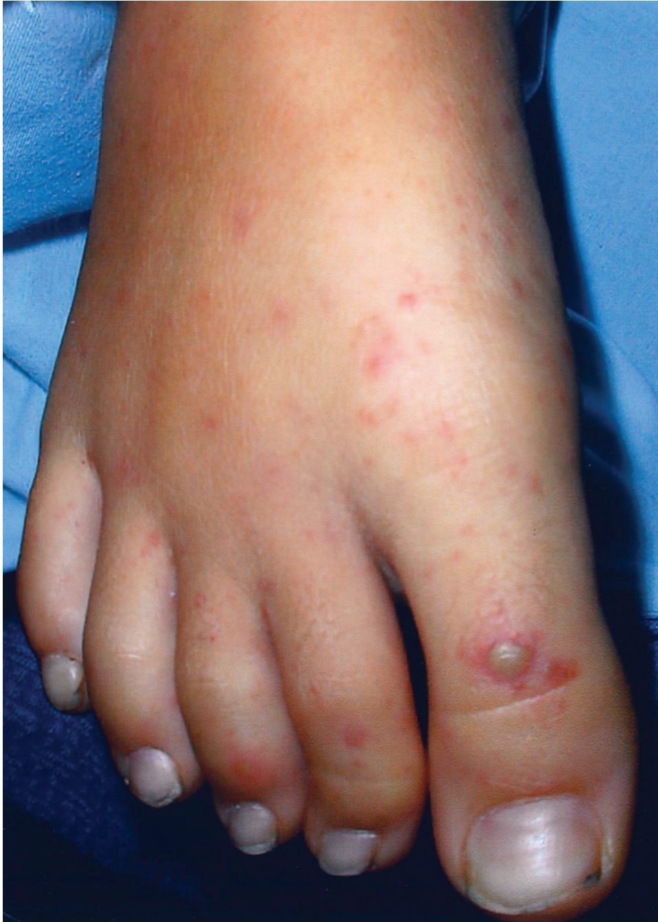
FIG. 3. Hemorrhagic vesicles on the first and third toes of a patient with advanced rat bite fever.

cardial effusion, bronchopneumonia, pneumonitis, periarteritis nodosa, volvulus, and overwhelming septicemia, with organisms found in both the adrenal glands and bone marrow at autopsy (14, 15, 62, 65, 72, 76). Although some patients appear to show spontaneous recovery from serologically confirmed disease (5, 13), a lack of effective antibiotic treatment is highly associated with death. Initiation of an appropriate antibiotic regimen usually precipitates rapid resolution of acute symptoms. However, some patients experience prolonged migratory polyarthralgias, fatigue, and slowly resolving rash.