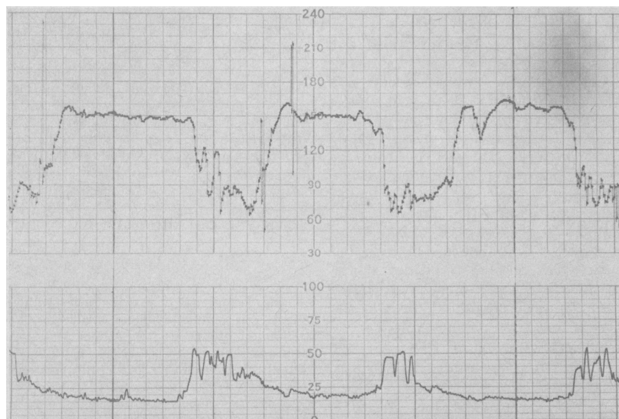
FIG. 2—Variable deceleration pattern of fetal heart rate in case of intrapartum fetal bleeding.

A blood film stained by the Kleihauer-Betke technique revealed a large number of fetal erythrocytes in the maternal blood, indicating fetal-maternal transfusion prior to birth. The baby was given a partial exchange transfusion with 90 mL of packed erythrocytes, after which the hemoglobin value was 14.7 g/dL. Jaundice developed and the serum bilirubin reached a maximum value of 14.6 mg/dL 4 days