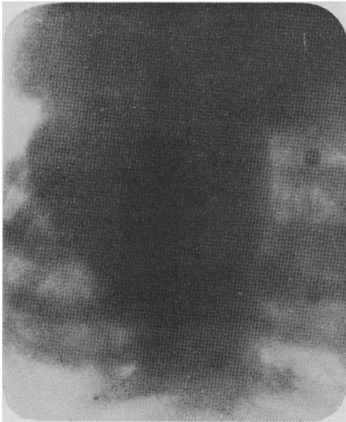
FIG. 4.—Frontispiece of H. S. Ward's (1896) Practical Radiography .

chose to call it, "stimulated the uneducated imagination" to a similar extent.