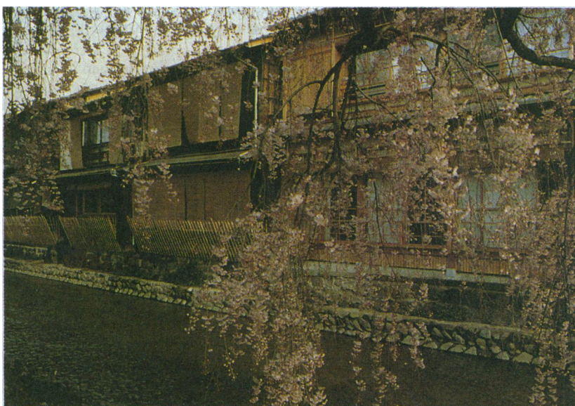
Street in Takayama

Widespread screening for cardiovascular disease and cancer was introduced in 1983. For people who do not have a regular check up at work the local health authority will provide one either directly or by con-