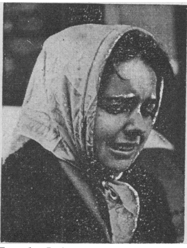
Fig. 5.-This distraught-looking girl was sold large quantities of aspirin.

once was any concern expressed: "Two hundred? Are you all right? You ought to go and have a cup of tea," though she received several curious glances and was watched through the window as she left more than one shop. A distraught-looking girl, 200 aspirins asked for, curiosity and interest, but no hesitation about the sale. This is irresponsible. The pharmacist. knows of the dangers of salicylates, should personally supervise their sale and should discourage purchases of more than 25 at a time. Indeed,