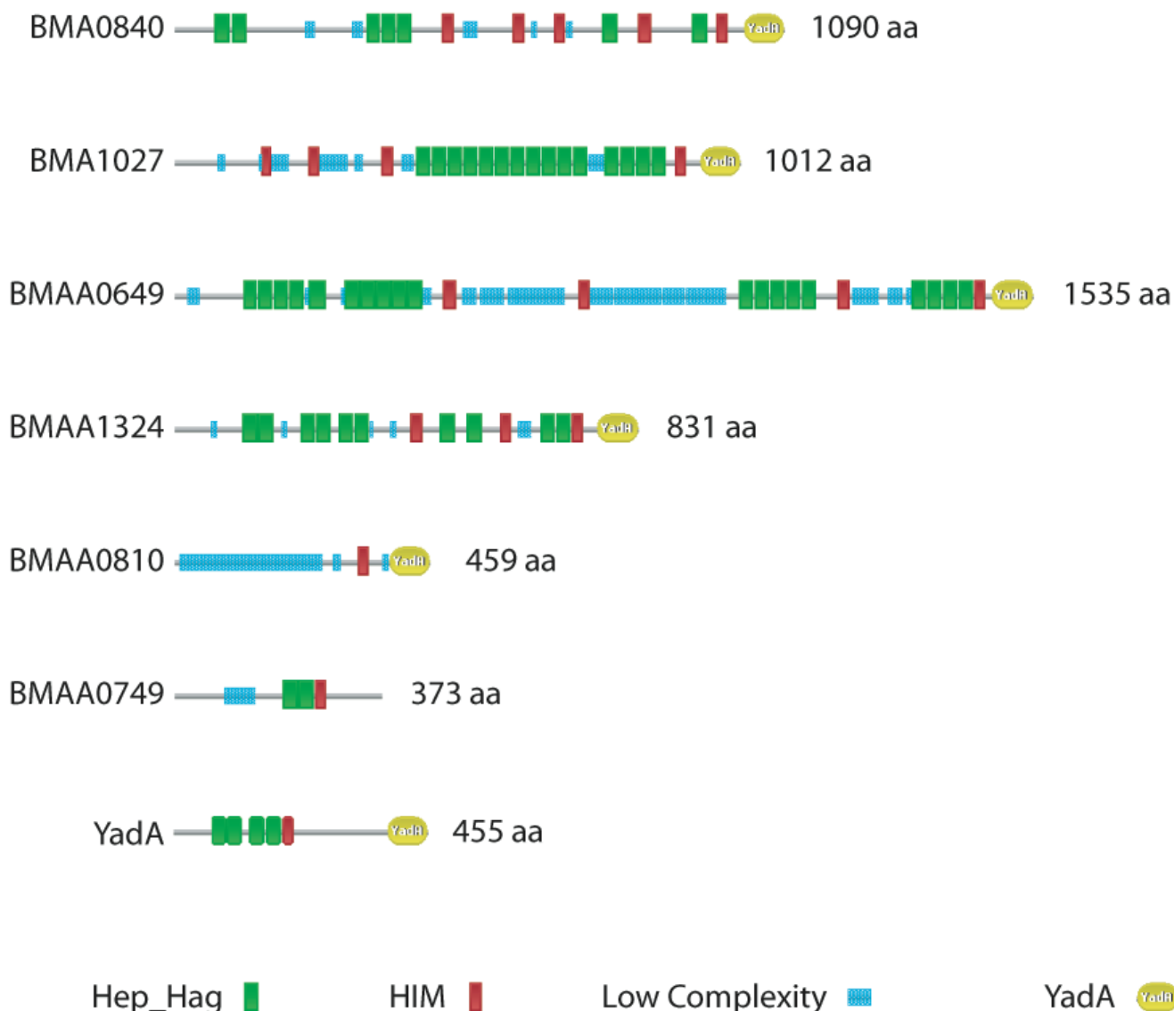
Figure 1 Domain architecture of Burkholderia mallei BuHA proteins. Pfam [36] domain organization of 4 immunodominant BuHA proteins of B. mallei , and 2 additional CDSs from B. mallei that contain Hep_Hag domains. Also included is the Yada protein from Yersinia enterocolitica (accession number YADA1_YEREN). Keys are shown for the domains in the bead diagrams.

element mediated recombination, a feature of the evolution of the B. mallei genome, appears to have resulted in the truncation of this CDS; it is likely that this CDS is a pseudogene. The other non-immunogenic member of this family is BMAA0749. This CDS contains Hep_Hag and HIM domains (Figure 1), but lacks a strong Pfam Yada domain match in the C-terminus; a weaker match to the Yada domain with a score below the Pfam gathering threshold (score 21.10, e-value 7.4e-06) was detected. This CDS also lacked an N-terminal signal sequence, and it is likely that the product is not processed to the external