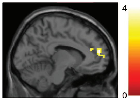
Fig. 1. Positive vs. negative social concepts. Whole-brain analysis at a voxel-level threshold of P = 0.005 (minimum cluster size = 10 voxels). The peak coordinate of the displayed anterior medial prefrontal (BA10/32) region is -12, 54, 18, Z = 3.64 . Regions not displayed here, which were additionally detected: left lateral orbitofrontal cortex (BA47/11), -42, 30, -15, Z = 4.44 ; dorsal anterior cingulate (BA24), -3, 0, 24, Z = 3.51 . No temporal lobe differences emerged on a whole-brain and anterior temporal ROI basis, also at P = 0.05 uncorrected. See also SI Fig. 4 for parameter estimates for positive and negative social concepts.

Our results are in agreement with the central role of the anterior temporal lobes for representing abstract conceptual knowledge (12–15, 28, 42), concepts denoted by composite expressions (43–45), and the importance of the right temporal lobe for social cognition (30). Subdivisions for different semantic domains (e.g., tools, animals, and faces) were demonstrated in modality-specific posterior temporal regions (35, 36, 46). This study demonstrates that specialized subregions for different conceptual domains also exist within the anterior temporal lobe. It has been argued that subdivisions for different object categories in the posterior temporal cortex do not necessarily reflect