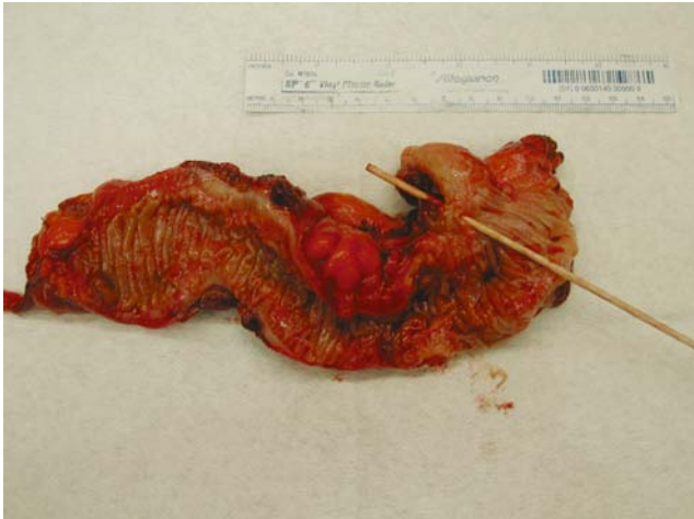
Figure 3 Gross specimen of the sigmoid colon that was resected from a patient who presented with freely perforated diverticulitis (Hinchey III). Proximal margin extends to the area where the diverticuli end, and the distal margin is at the rectum.

an increased rate of either complications or less successful medical management. 19