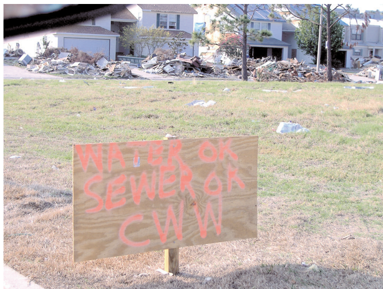
FIGURE 2—Communication of availability of water and sewer services by signboard adjacent to hurricane-affected community, Louisiana, 2005.