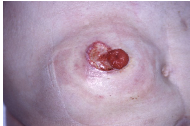
Figure 4 Peristomal pyoderma gangraenosum in ulcerative colitis.

Tumour necrosis alpha inhibitor infliximab was reported to be effective in PG associated with inflammatory bowel disease at a dosage of 5 mg/kg body weight. Infliximab is given by infusion at weeks 0, 2 and 6, and every 8 weeks thereafter. The chimeric antibody is usually combined with low-dose methotrexate for Crohn's disease [54,55]. In a small series including 4 patients with fistulating Crohn's disease and PG infliximab was given either as a single infusion or a series of three infusions at a dosage of 5 mg per kg body weight/day. All patients demonstrated a rapid healing of PG within 4 weeks after starting the treatment. Healing was complete and relapses were not observed [56]. In another study four patients with PG-ulcers and Crohn's disease showed a marked improvement after a single infusion of infliximab [57]. Since infusion reactions can occur in 3% to 17% of patients with Crohn's disease that are antibody associated the concurrent administration of steroids and the use of immunosuppressant like methotrexate or azathioprine has been recommended [58].