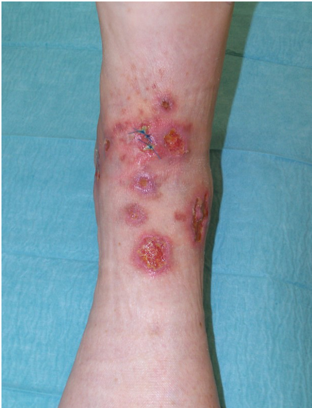
Figure 3 Ecthyma-like pyoderma gangraenosum.

Tumour necrosis alpha inhibitor infliximab was reported to be effective in PG associated with inflammatory bowel disease at a dosage of 5 mg/kg body weight. Infliximab is given by infusion at weeks 0, 2 and 6, and every 8 weeks thereafter. The chimeric antibody is usually combined with low-dose methotrexate for Crohn's disease [54,55]. In a small series including 4 patients with fistulating Crohn's disease and PG infliximab was given either as a single infusion or a series of three infusions at a dosage of 5 mg per kg body weight/day. All patients demonstrated a rapid healing of PG within 4 weeks after starting the treatment. Healing was complete and relapses were not observed [56]. In another study four patients with PG-ulcers and Crohn's disease showed a marked improvement after a single infusion of infliximab [57]. Since infusion reactions can occur in 3% to 17% of patients with Crohn's disease that are antibody associated the concurrent administration of steroids and the use of immunosuppressant like methotrexate or azathioprine has been recommended [58].