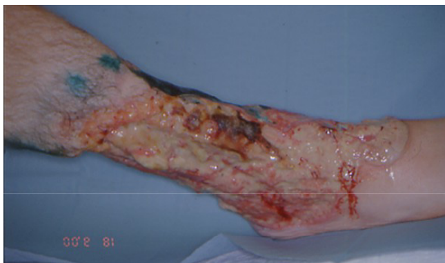
Figure 5 Deep purulent ulcerations due to pyoderma gangraenosa. In this patient later on a lower limb amputation was necessary, since he did not response to drug therapy.

For small flat lesions without secondary infection, topical high potent corticosteroids are in use. They are rarely capable of inducing remissions except in peristomal PG [4,10,11]. Topical calcineurin inhibitors like tacrolimus or pimecrolimus were used in some cases with success [4,63,64]. Dramatic improvement has been observed in particular in peristomal PG [65,66].