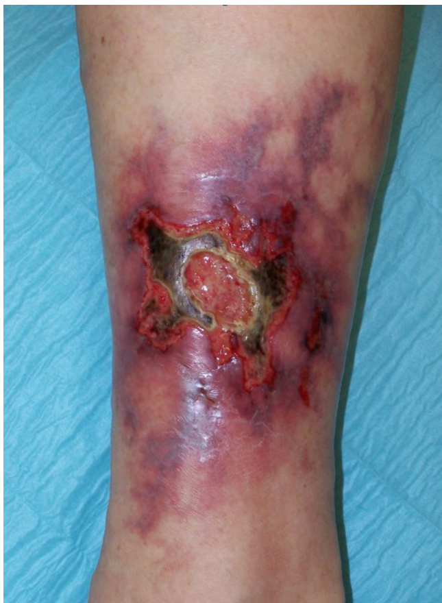
Figure 1 Acute rapid growing pyoderma gangraenosa with undermined violaceous borders.

a deep suppurative folliculitis with dense neutrophilic infiltrate. In about 40% of cases, leukocytoclastic vasculitis is present. PG with [necrotizing] granulomatous inflammation has been described [3,34,37]. These reports illustrate the difficulties of a diagnosis based solely on histopathology since concomitant occurrence of PG and systemic necrotizing vasculitis has been observed.