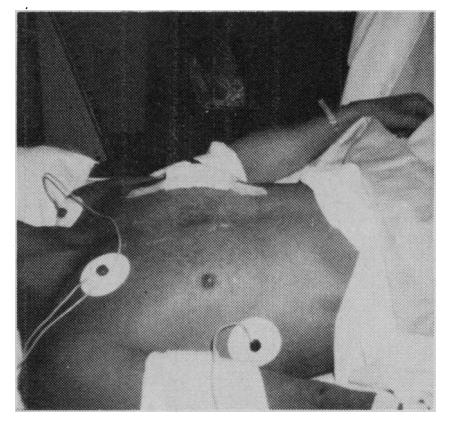
FIG. 1—Erythema following onset of toxic shock syndrome.

The wound was incised but there was no further drainage. Culture yielded penicillin-resistant S. aureus , phage group II, type 55 (the phage-typing was done by the staphylococcal reference laboratory, ministère des Affaires so-