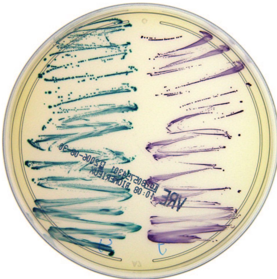
FIG. 1. VRE-BMX medium plated with E. faecalis and E. faecium . This figure demonstrates the ability of VRE-BMX to identify E. faecium and E. faecalis based on the color of the colony; on VRE-BMX, colonies of E. faecalis appear blue-green and colonies of E. faecium appear purple. For the purposes of this study, fecal specimens were plated directly to VRE-BMX and BEAV and observed for growth at 24 and 48 h.

of VRE from stool samples obtained from hospitalized patients.