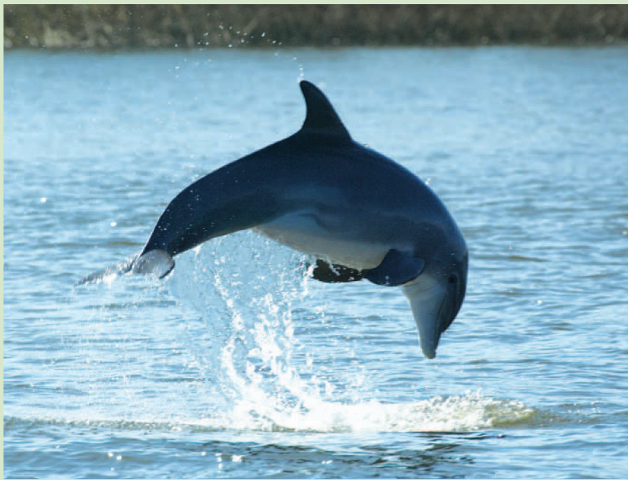
Studies of bottlenose dolphins with some of the highest levels of PFOS reported in wild animals indicate that the chemical may affect immune function.