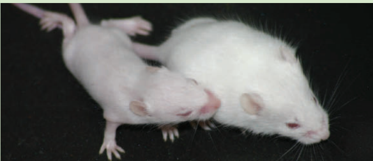
Laboratory mice exposed prenatally to PFOS and PFOA develop more slowly and suffer a higher rate of neonatal mortality than nonexposed mice (left). Once exposed mice reach adulthood, however, they are more likely to become obese (above).

last effect is arguably the most dramatic result of laboratory animal tests with PFOS and PFOA. “Animals are born, they look quite healthy and pink, and then they die quite rapidly,” Seed says. Other studies show that the compounds can impact growth and development and disrupt the body’s hormone and immune systems.