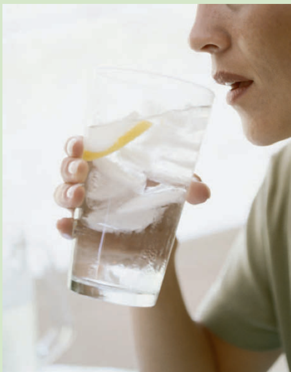
Human exposure to PFAAs comes through myriad sources including contaminated drinking water and household products treated with stain or water repellants.

But some of the new replacement compounds may pose problems of their own. More than 20 different such compounds were discussed at a 14–16 February 2007 meeting of the Society of Toxicology (SOT) on the toxicokinetics and mode of action of PFAAs and related chemistries. For example, fluorotelomer alcohols are emerging as the main remaining source of PFOA in the environment. These and other “residual”