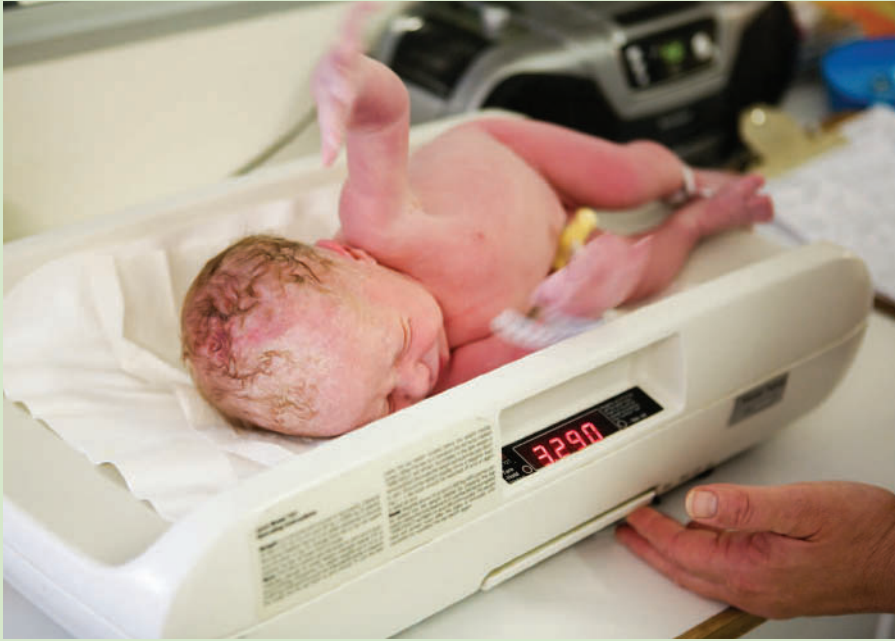
Prenatal exposure to PFOS and PFOA can affect body weight and head circumference in human infants. Postnatal exposures, as through breastfeeding, have unknown effects.