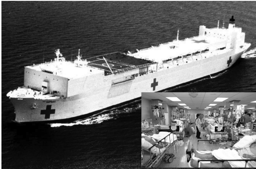
FIGURE 3. USNS Comfort (TAH-20) underway. Inset: ICU #2 at height of operations, over 30 ventilated patients with multiple traumatic casualties were managed in relatively tight quarters.

culture data, and antimicrobials given prior to the development of WTAI. In addition, a composite trauma Injury Severity Score (ISS) was calculated on all patients as detailed by the methods of Baker et al. 8