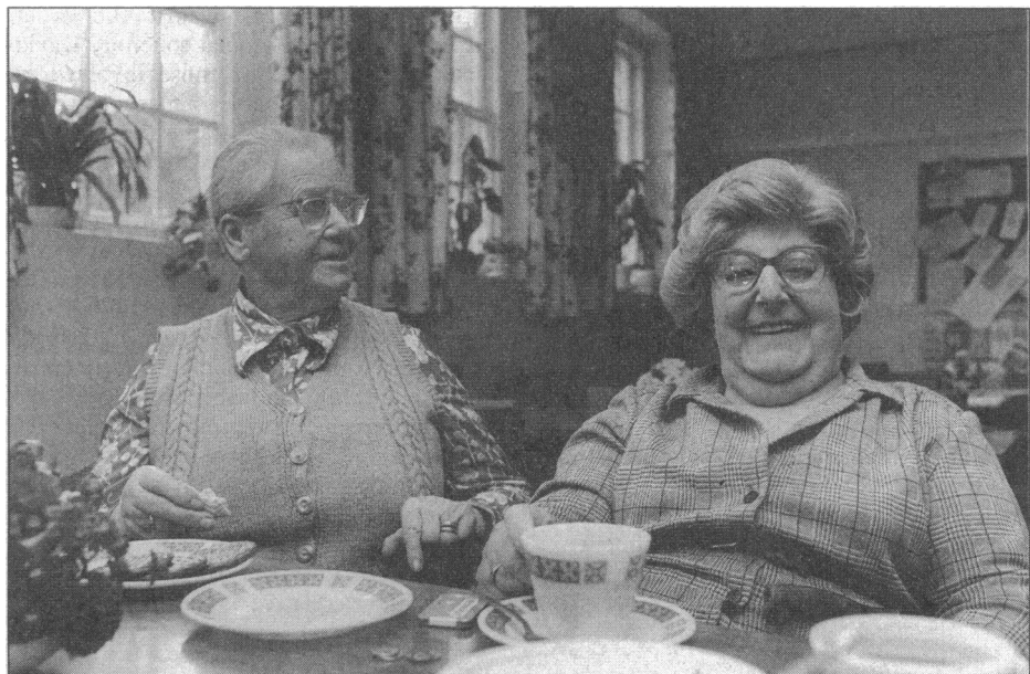
Making the seamless web work: a priority for 1993

In practice, regions, districts, family health services authorities, provider units, and general practice fundholders will have to respond to a detailed set of demands. Under the overall objective of improving health, for example, the NHS will not only have to meet the targets set out in Health of the Nation ; authorities also have to improve maternity