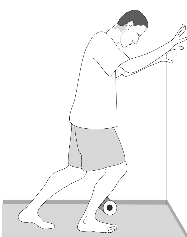
Figure 1 Dorsiflexion lunge test procedure. An inclinometer has been placed on the anterior aspect of the tibia. The angle recorded to the vertical was used as a measure of ankle dorsiflexion ROM.

into the logistic regression, a series of chi-square analyses were undertaken to ascertain whether they were correlated. A non-significant chi-square was calculated in each case and taken as evidence that the predictor variables were not correlated to each other, thereby meeting the independence assumption of logistic regression.