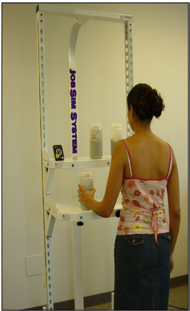
Figure 2 Task 1, "Waist-Up".

In the first task ("waist-up"), a shelf was placed at waist level and a second shelf was placed 25 cm above it; three 1-kg containers were placed 10 cm apart on the lower shelf (Figure 2). Using the affected arm, the patient would