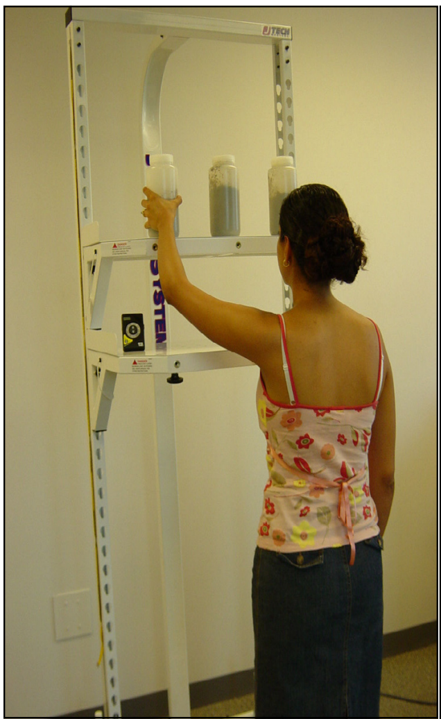
Figure 4 Task 2, "Eye-Down".

1. To develop a test protocol that could be completed by most subjects without shoulder pathology, but sensitive to detecting functional impairment across a spectrum of severity (mild to severe).