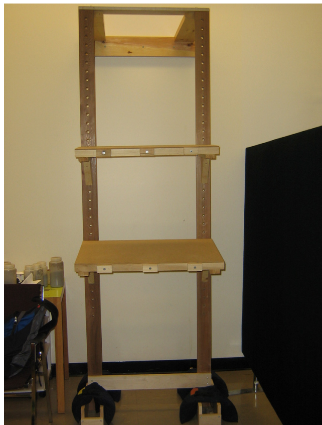
Figure 3 Wooden Version of the FIT-HaNSA.