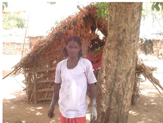
Figure 2 A Saharia man.