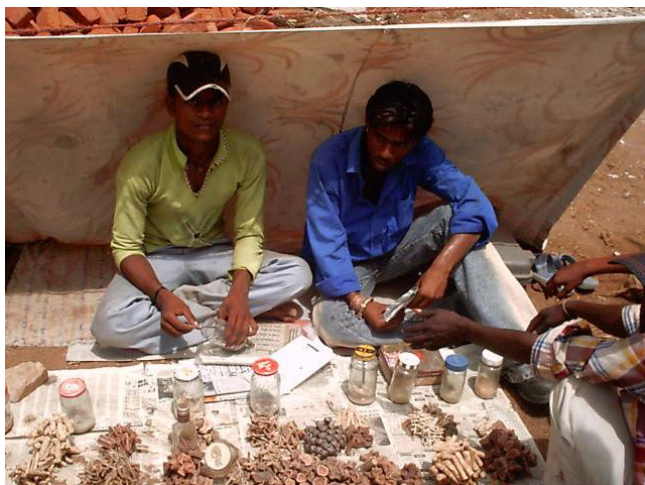
Figure 3 Local vendors selling medicines at a fair.

same major purpose. The uses of animals that are commonly known by the respondents have higher fidelity level than less common known. The soup of Capra ' legs bone used to cure weakness has the highest FL (100%) and semen of Equus sp. has the lowest (9%). Obviously, the remedies for frequently reported ailments have the highest FL value and those with low number of reports have lowest FL values.