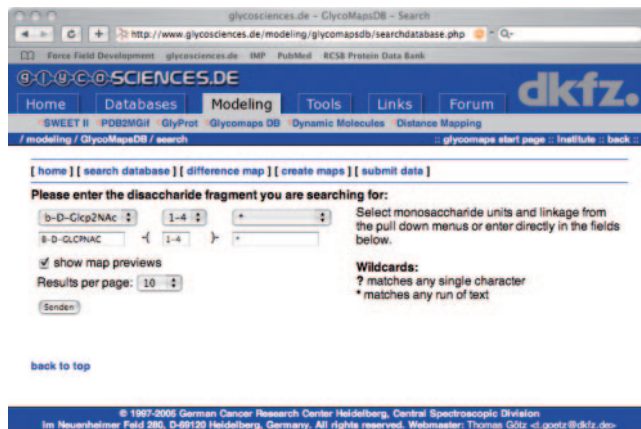
Figure 1. The search database interface of the GlycoMapsDB. Monosaccharide residues can be selected from the pull down menus or entered directly into the appropriate fields. Wildcards are supported.

Conformational maps of carbohydrate linkages can be retrieved from the database by entering the disaccharide fragment in IUPAC form into the search database web interface of GlycoMapsDB (Figure 1). Wildcards are supported, which allows searching, e.g. Glcp and Glcp2NAc residues simultaneously. Maps found in the database are displayed as a list, with each entry showing a preview picture and the full structure of the carbohydrate for which the map has been calculated in extended IUPAC form (Figure 2). Difference maps can be calculated e.g. to evaluate the influence of branching on the accessible conformational space of a linkage (Figure 3). Individual maps can be explored in more detail by clicking on the preview picture. A 3D structure of the carbohydrate—generated by Sweet II (10)—can be displayed using Jmol (jmol.sourceforge.net). If experimental data for the disaccharide fragment is available in the Protein Data Bank (PDB) (12), a link is displayed, which leads to a page where \phi/\psi torsion values retrieved from PDB data [using the