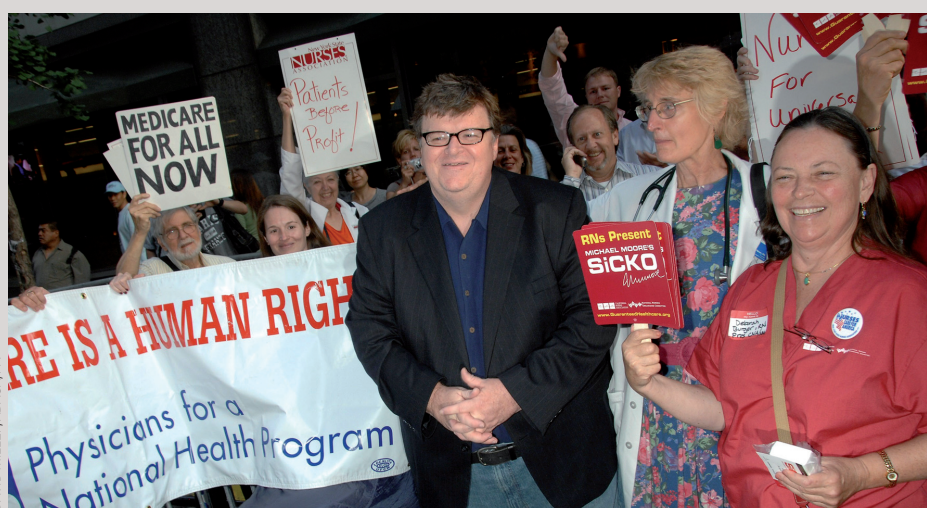
Michale Moore arrives for the New York premiere of his film Sicko about the healthcare industry