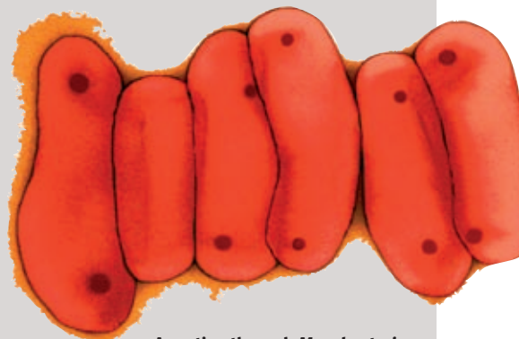
A section through Mycobacterium tuberculosis bacteria

The plan “must be supported if we are to keep a stranglehold on drug resistant TB”