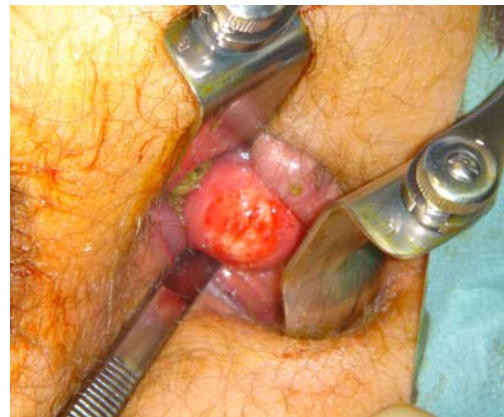
Fig. 4 Excision of the rectal calculus in the operating room