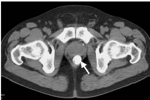
Fig. 2 Computerized tomography (CT) scan showing the rectal calculus in the center ( arrow )