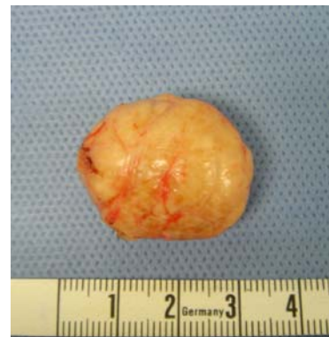
Fig. 5 Excision revealed a turnip-like lesion, dimensions 3.1 \times 2.3 \times 1.8 cm