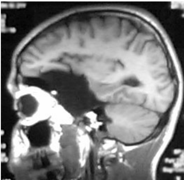
Figure 3 Cranial MNR image in a sagittal plane, showing the orbitofrontal portion of the cyst.

idence in which the arachnoid cyst is just an 'innocent bystander' to the development of a functional psychosis.