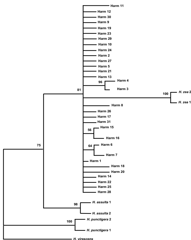
Figure 2 Maximum Likelihood (ML) tree of H. armigera (Harm-1 to Harm-31), H. zea (Hzea-1, Hzea-2), H. assulta and H. punctigera based on partial COI haplotypes sequences. Numbers above the nodes indicate bootstrap support. The outgroup used was Heliothis virescens . The inclusion of additional haplotypes Harm-32, Harm-33, and Hzea-3 to Hzea-11 did not alter the overall topology, and bootstrap values of the ML tree after 1,000 bootstrap replications remained high, with all H. zea haplotypes confidently clustered (bootstrap value = 96) within the H. armigera clade. H. punctigera remained basal to H. assulta (bootstrap value = 99), and the H. armigera / H. zea clade (bootstrap value = 78) shared a most common ancestor with H. assulta (bootstrap value = 97) (data not shown).

species. A monophyletic relationship between H. armigera and H. zea (with low bootstrap support values and limited sample sizes) was inferred based on the nuclear Elongation Factor 1-alpha (EF1- \alpha ) gene [45] and the Dopa Decarboxylase (DDC) gene [46], while a DDC and EF-1 \alpha multi-gene phylogeny also supported monophyly between H. zea and H. armigera with a higher bootstrap value [46].