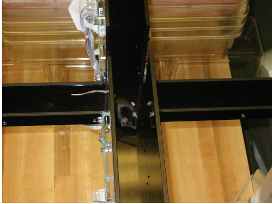
FIGURE 1: Elevated plus maze: the mice are tested for 10 minutes; while they are curious to explore the open areas, they are anxious to do so.

darker arms, but they like to explore the open arms and poke over the edge. Less anxious mice will venture more onto the open arms, and poke their heads more over the edges of the open arms. Male Apoe -/- (C57BL/6J- Apoe tm1Unc ) and wild-type C57BL/6J mice were obtained from the Jackson Laboratory (Bar Harbor, Me). When measures of anxiety in the elevated plus maze were assessed in 6-month-old Apoe -/- male and wild-type control mice, Apoe -/- mice showed increased measures of anxiety [13]. These changes are age-dependent and not seen in 3-month-old mice.