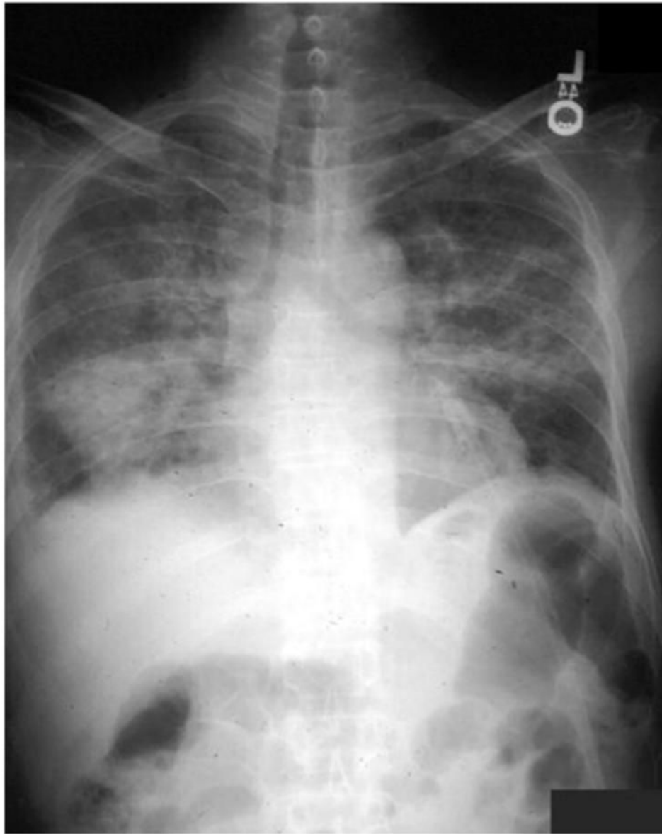
Figure 1. Chest radiograph of a Vietnamese man in the United States for 8 years, with fever, rash, and pneumonia after receiving steroids for uveitis.