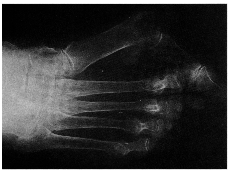
FIG. 2B-Radiograph showing osteoporosis, metatarsal head erosion and forefoot disorganization.