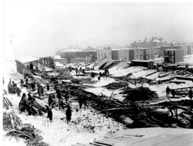
Figure 2 Collapsed buildings in the North End of Halifax, Nova Scotia, Canada.

Tooke was taken aback by the state of the untreated injuries, “practically every face wound was septic; nay more, each was welling out with a copious purulent discharge while other