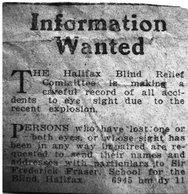
Figure 4 Saturday, 5 Jan 1918: The Evening Mail. Halifax Relief Committee requests information from persons who sustained eye injuries in the Explosion.