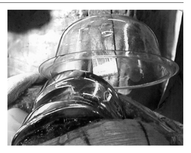
Figure 2 Splash shield advanced down osteotome prior to use.

shield using a scalpel. The required osteotome is then inserted through this hole (Fig. 1). The osteotome is then positioned at the point at which cement removal is to begin. This is easily visualised due to the clear plastic of the splash shield. Following positioning, the splash shield may be advanced down the osteotome so as to minimise the gap of potential cement chip escape (Fig. 2). The use of the osteotome may then commence. In this way, any cement chips that are sprung away from the field simply travel as far as the inside of the splash shield and then return to the operative site. Following sufficient cement removal, the shielded osteotome can be withdrawn and the chips recovered. The process may then be repeated as necessary. In using this technique, the cement chip displacement is controlled, while still allowing an excellent view of the operative field.