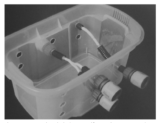
Figure 1 A completed 'do-it-yourself' vascular anastomosis surgical simulator.

Drill a number of holes in the side of the plastic storage box. Cut the hose into approximate 10 cm lengths and push through the holes. The garden hose connectors can be added optionally to allow connection to a water supply to test the anastomosis. The double cone adaptors are glued into position in the hoses. This