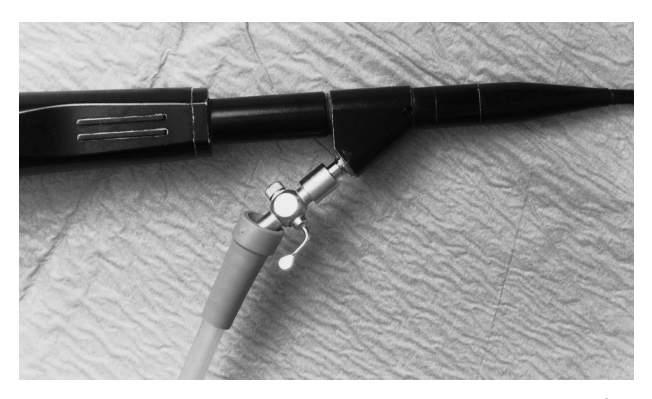
Figure 1 Suction tubing attached to the instrument port of the flexible cystoscope.

During flexible cystoscopy, visualisation of the bladder mucosa can be impaired due to debris, blood or a large residual volume of urine within the bladder. A simple technique using suction applied to the instrument port of the cystoscope can be employed to empty the bladder (Fig. 1). Under direct visualisation of the bladder mucosa, 40–60 Kpa of suction is applied and the bladder gradually emptied. By allowing ingress of air between suction tubing and the cystoscope, the suction pressure can be varied. This technique is simple to perform, avoids traumatic re-instrumentation and prevents unnecessary further visits for rigid cystoscopy.