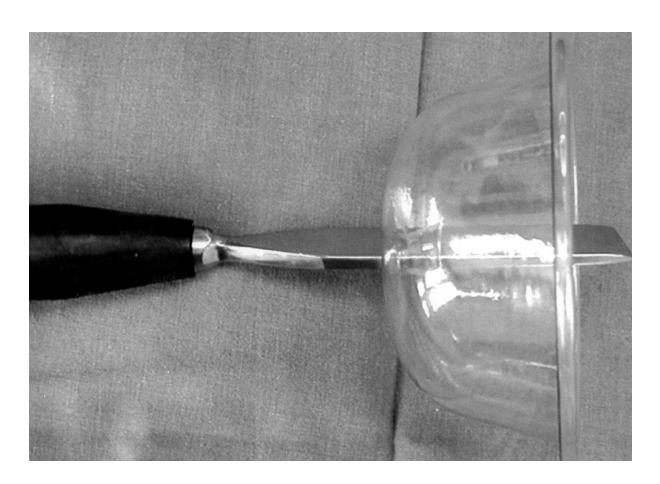
Figure 1 Splash shield with osteotome inserted.

In this technique, a standard, clear splash shield is used (e.g. the MicroAire<sup>®</sup> 4-inch Splash Shield); alternatively, the prosthesis or ravage tubing container may be used. Prior to commencing cement removal, a small hole is made in the base of the splash