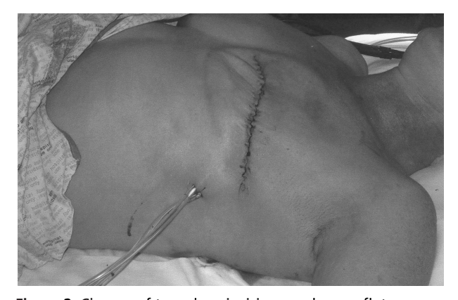
Figure 2 Closure of tear-drop incision produces a flat scar and no dog-ear deformity.

The technique described seldom produces any dog-ear deformity in our practice, and is suitable for both small- and large-breasted women and those with excessive fat along the axillary fold. It incorporates the tumour and provides adequate clearance of the primary lesion and good exposure to axilla. A cosmetically sound and flat scar is obtained (Fig. 2) that is suitable for the new 'stick on' prosthesis.