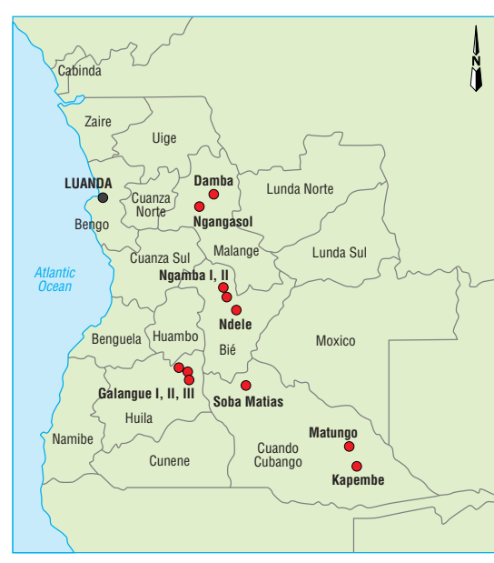
Fig 1 Name and location of 11 resettlement camps for former UNITA members and their families included in the survey. (Base map provided by ReliefWeb-UN OCHA on 30 January 2003; modifications by Epicentre on 31 January 2003)