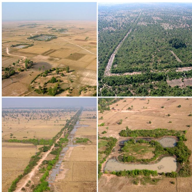
Fig. 1. Oblique aerial views of remnant Angkorian urban features. (Upper Left) Occupation mounds and ponds. (Upper Right) Canals and embankments. (Lower Left) Multifunction roadway/canals. (Lower Right) Classic “village temple” configuration.

Pottier also showed decisively that the great reservoirs, or barays , had inlets and outlets and were connected to a network of channels and embankments, contrary to the assertions of critics of Groslier’s hydraulic thesis from the 1980s onwards (11–14). Moreover, the longstanding assumption (2, 11) that the extensive agricultural field systems visible on the surface today might date from Angkorian times was supported by his new map, which displayed the integral connection between the local temples and their agricultural space (15). Various other elements of the classical Angkorian landscape, in particular, the small ponds described in an account of Angkor in the 13th century (16), have also persisted on the surface, were clearly identifiable from the air and have often been renovated and reused by the contemporary Khmer population. Archaeological evidence of Angkorian occupation (in particular, brick and ceramic debris) was consistently found at the sites that had been identified from the air and was documented and collected wherever appropriate (10). Field verification continues across the greater Angkor region in a process that has consistently matched aerial observations with surface evidence. Recent excavations at the Siem Reap airport (17) and elsewhere have provided further stratigraphic evidence of continuity between subtle topographic features visible on the surface today and the urban landscape of medieval Angkor.