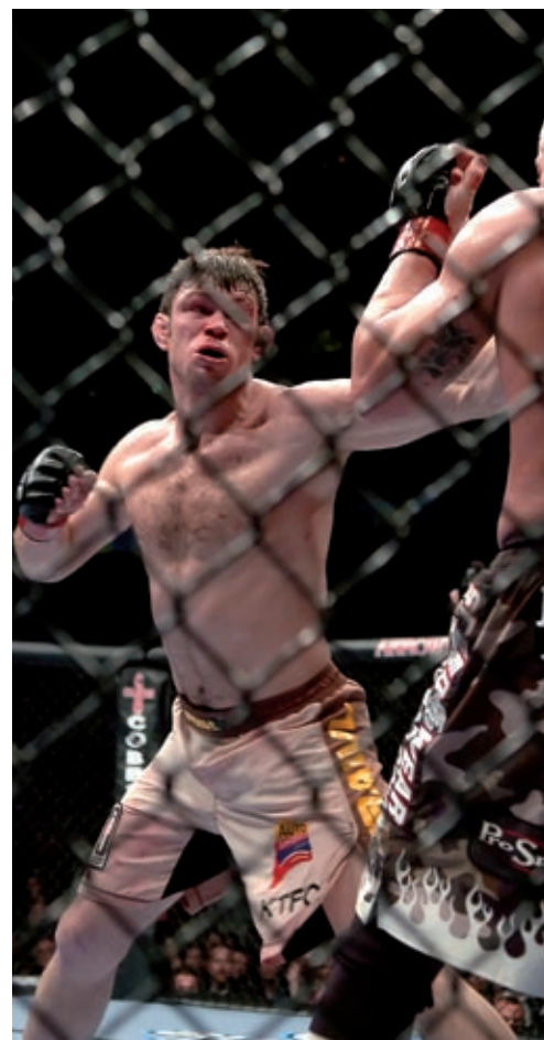
The Ultimate Fighting Championship in California

The report, Boxing: An Update is available at www.bma.org.uk .