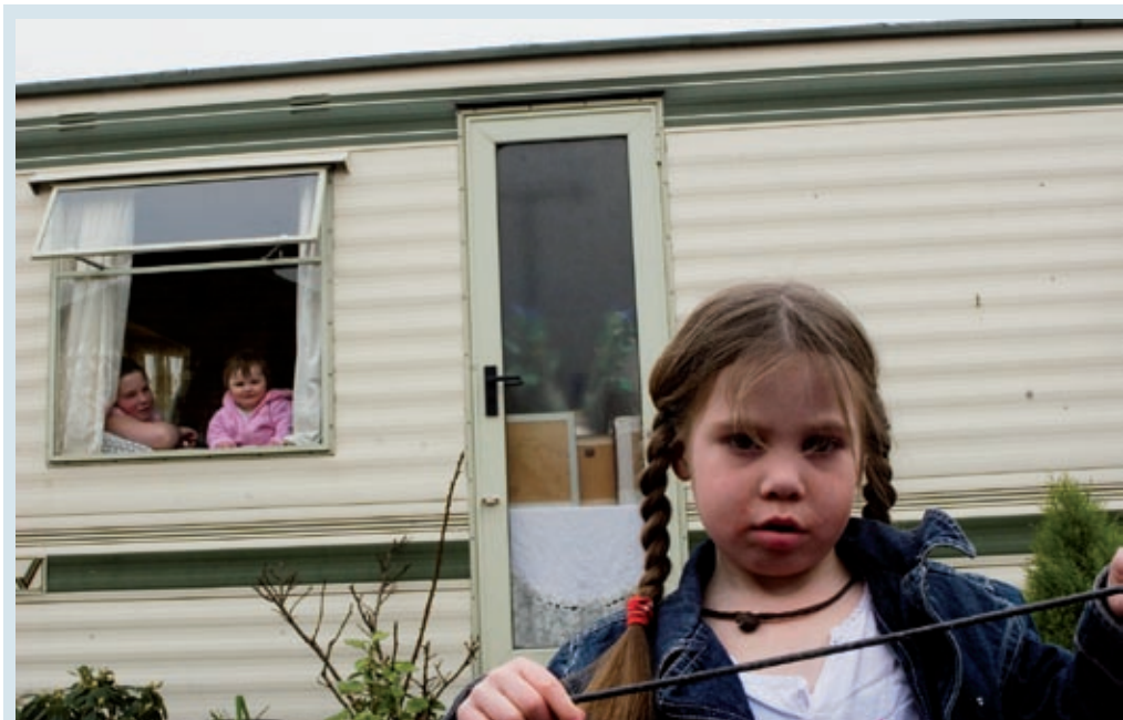
The measles increase is in communities where uptake of the MMR vaccine is low, such as travelling families

Several experts later said that S aureus was a postmortem contaminant, although an expert for the defence at the second appeal thought infection was the likely cause of death.