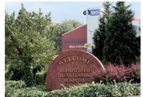
Two patients with cancer died in July after being given the wrong dose of amphotericin

There had been 53 incidents involving the drug between January 2004 and July 2007