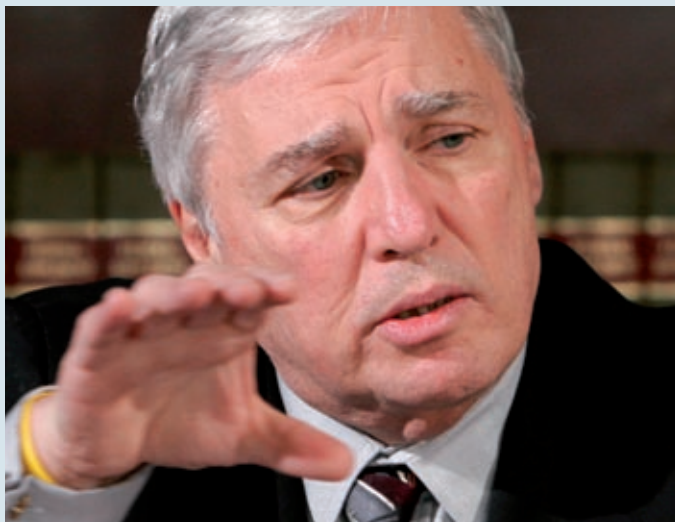
Andrew von Eschenbach, 66, trained as a surgeon. President George Bush chose him to take over at the FDA in 2005.