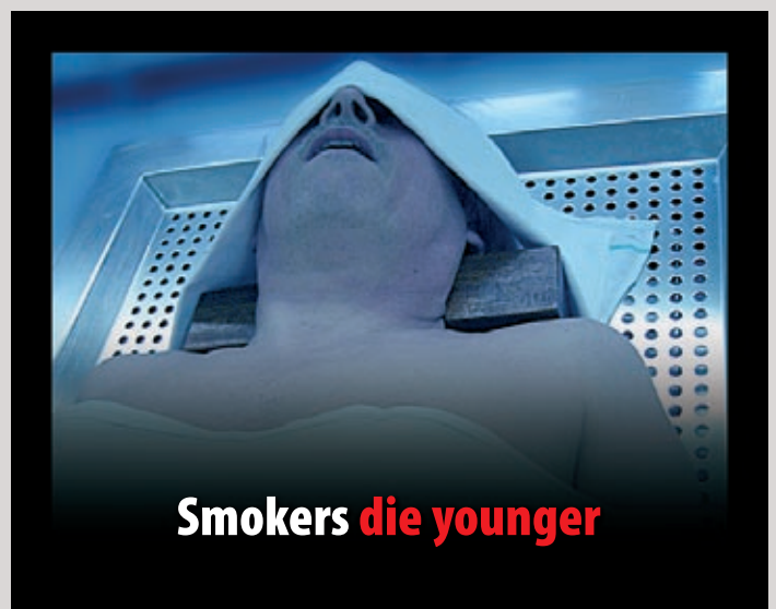
One of the images to appear on cigarette packets from 2008