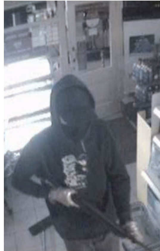
Hold up caught on security camera

Small Arms Survey 2007: Guns and the City is available at www.smallarmssurvey.org .