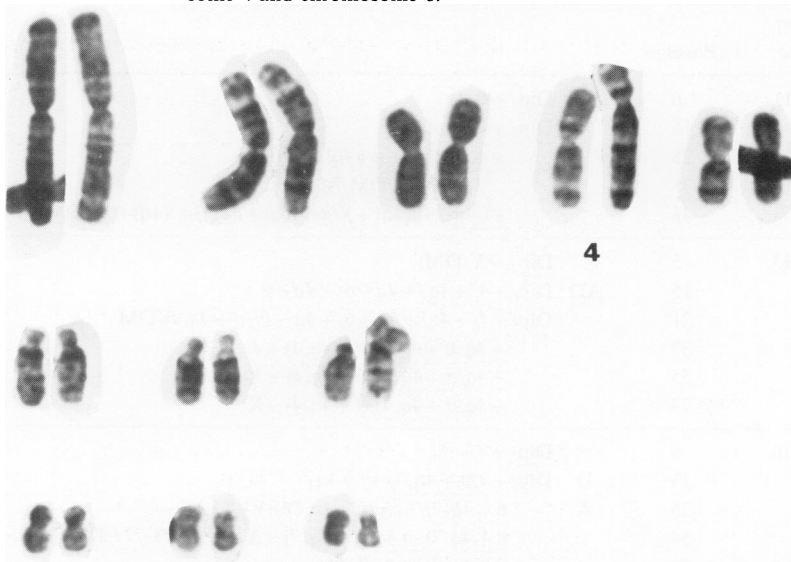
Figure 2 Metaphase of CH3 (passage 75) showing the translocation between the additional long arm of chromosome 4 and the telomere of the long arm of a complete chromosome 4.