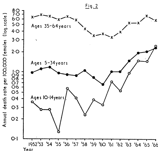
FIG. 2.—Asthma mortality in females aged 10 to 14 years, 5 to 34 years, and 35 to 64 years in England and Wales from 1952 to 1966.

Table II shows the changes since 1959 in greater detail. Since the male and female rates have been approximately equal the figures for both sexes have been combined to reduce the effect of random fluctuation due to small numbers. From Table II it is evident that an increase in mortality began to occur in about 1961 and that all ages between 5 and 64 years of age have been affected. The greatest increase in mortality has taken place at ages 10 to 14 years, at which ages the rate has increased eight times, from 0.3 to 2.5 per 100,000 persons. The increase has, however, been substantial at all ages from 5 to 34 years, and at these ages the annual number of deaths increased by 308 and the death rate trebled from 0.7 to 2.2 per 100,000 persons.