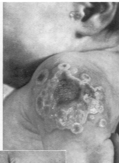
FIG. 1.—Primary and secondary lesions three weeks after vaccination.

weighing 8 lb. 8½ oz. The rectal temperature was 99° F. At the vaccination site on the left deltoid region was a yellowish ulcerated area 2.5 cm. in diameter surrounded by numerous vesicles, varying in size from 5 to 20 mm. in diameter, and containing clear fluid (Fig. 1). A number of large umbilicated vesicles surrounded the vulva and