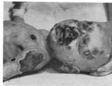
FIG. 5.—Spreading lesions on the face six weeks after vaccination.

ulcers. Lesions in the nostrils led to nasal obstruction and interfered with feeding. The eyelids became involved two weeks before death but the eyes themselves were not affected (Fig. 5). In the mouth ulcers appeared on the tongue, the palate and the cheeks. The cry became hoarse and laryngeal involvement was suspected. None of the lesions ever showed any signs of healing and there was little evidence of inflammatory reaction except for an area of cellulitis surrounding deep ulcers on the left foot. The spleen and lymph nodes were never enlarged. There