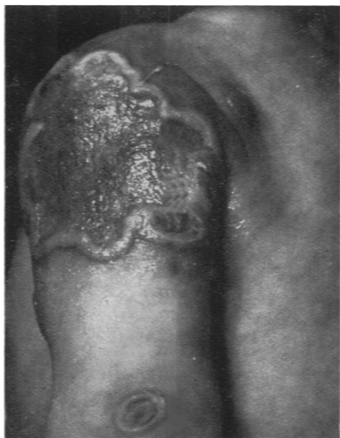
FIG. 4.—Primary lesion five weeks after vaccination. Secondary lesions at various stages of development can be seen on the scapular region and the arm.

From the time of her admission until her death four weeks later there was steady deterioration in her condition. The vesicles on the left deltoid area coalesced and eventually formed a large ulcer with a granulating base and rolled vesicular edge (Fig. 4). Vesicles continued to appear on the face, scalp and the rest of the body in a centrifugal distribution. Many of the lesions coalesced and, like the primary lesion, formed large, spreading