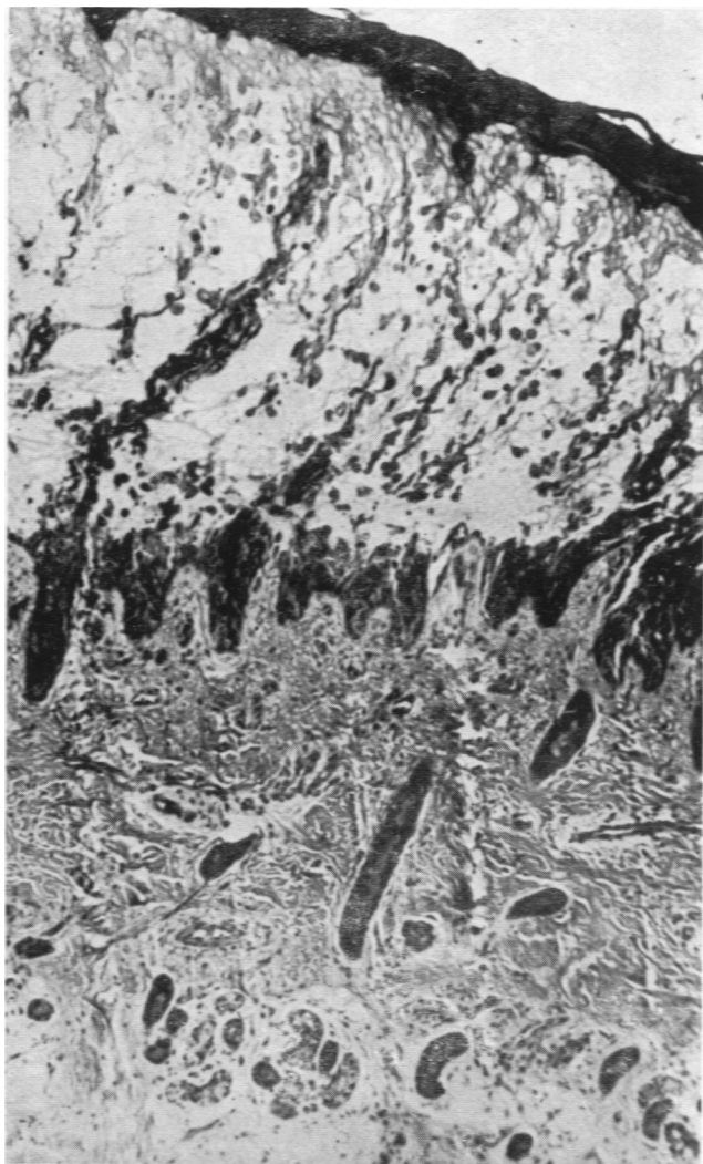
FIG. 6.—Section of vesicle from sole of foot showing absence of inflammatory cells in the dermis (low power haematoxylin and eosin).

Virus Studies. On December 13, the day of admission to hospital, scrapings were taken from the base of a typical secondary vesicle. Smears made from these were fixed and stained by Gutstein's method using alkaline methyl violet. Large numbers of elementary bodies were present, indistinguishable from those seen in smears from cases of smallpox. Swabs were taken from a typical early