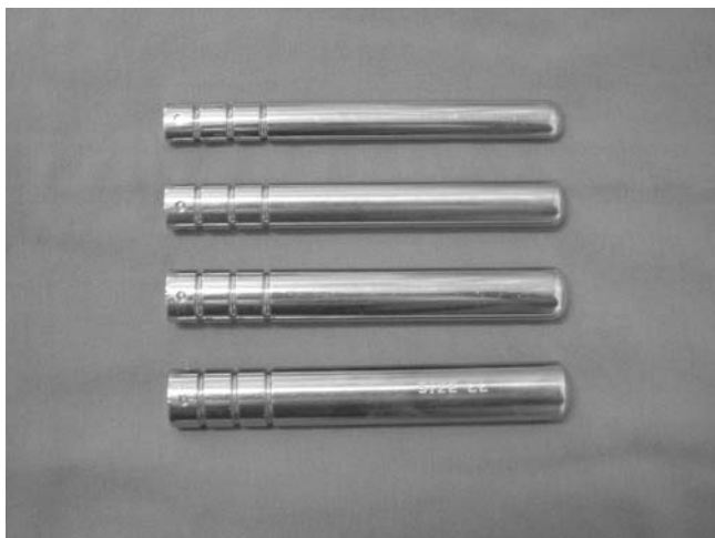
Figure 3 Metallic bars made mimicking the fibular shape were used for trials. There are 4 sizes: 12, 14, 16, 18 mm in width.