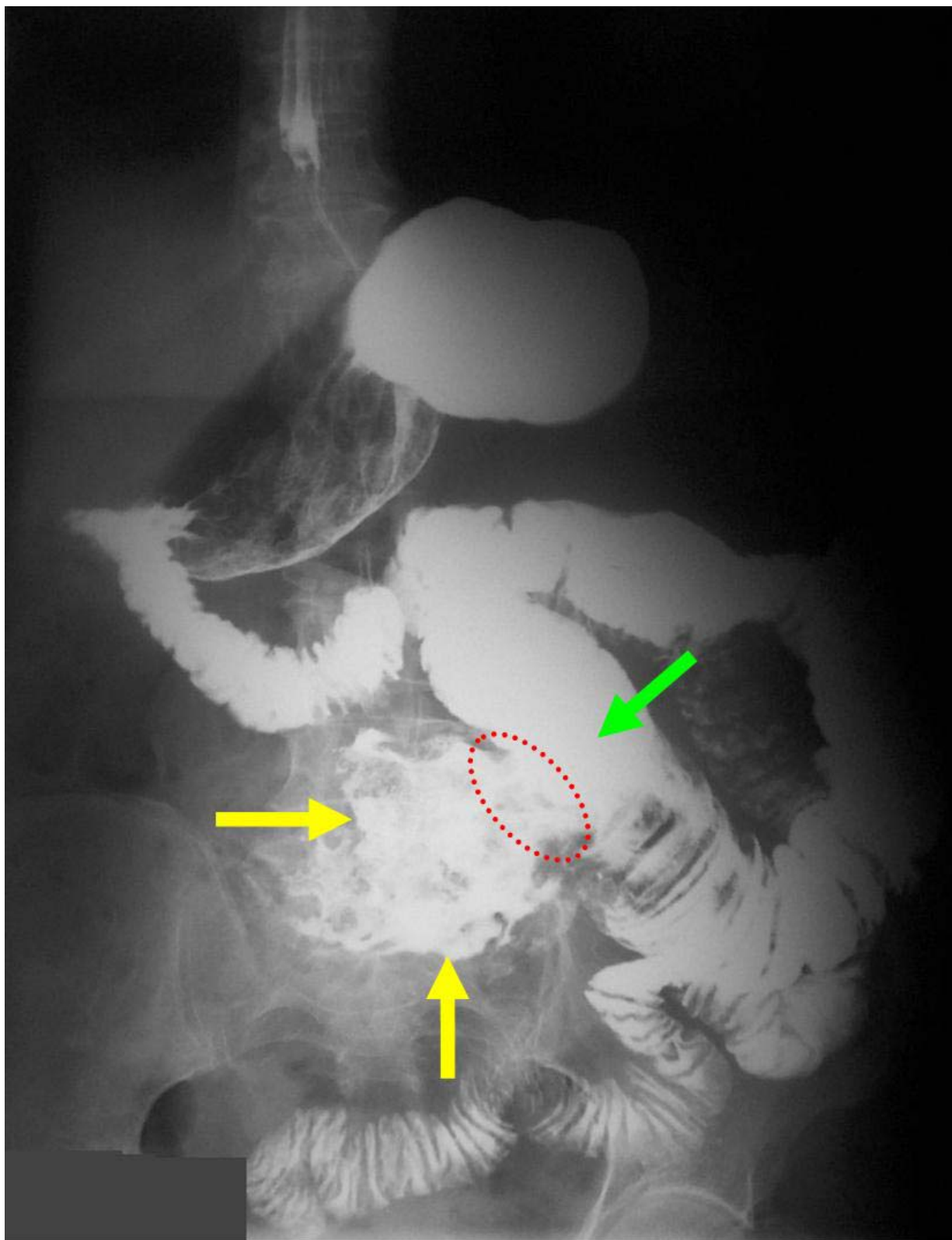
Figure 2 Upper gastrointestinal contrast study showed a fistula (red interrupted ring) between the cavity containing the foreign body (yellow arrows) and the jejunum (green arrow).