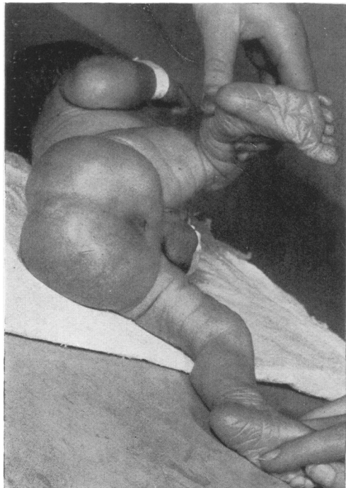
FIG. 2.—Clinical photograph showing the position and size of the tumour.