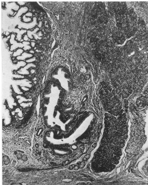
FIG. 4.—Photomicrograph showing cyst lined with alimentary mucosa, duodenal glands close by, pancreatic tissue in the lower right part of the field and, to the right of that, structure resembling a sympathetic ganglion.

Because of the risk of malignant change early removal of the tumour is indicated. Removal may