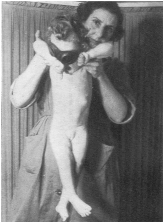
FIG. 7.—When the child is held free in the air, the feet point downwards and the legs sometimes cross.