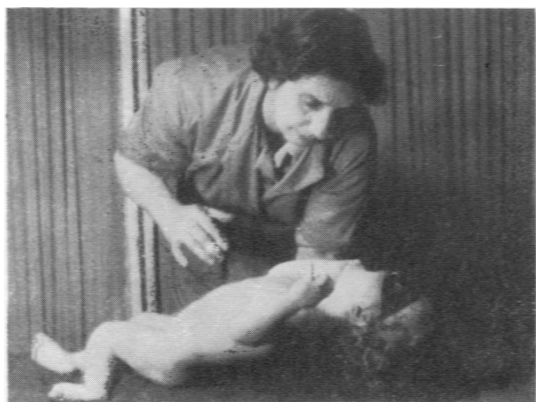
FIG. 1.—Extensor spasticity in the extensor position.

TESTING FOR THE INFLUENCE OF THE ASYMMETRICAL TONIC REFLEX ON THE ARMS. As already described, the infant usually lies on his back with the arms in abduction and flexed at the elbows. The examiner turns the head of the child to one side and holds it in this position for a few seconds. The arm to which the face is turned may then extend spontaneously, while the contralateral arm becomes more flexed (Fig. 2). In some cases the 'face-arm' may not extend spontaneously, but passive extension of the elbow will be less resisted than before the face was turned