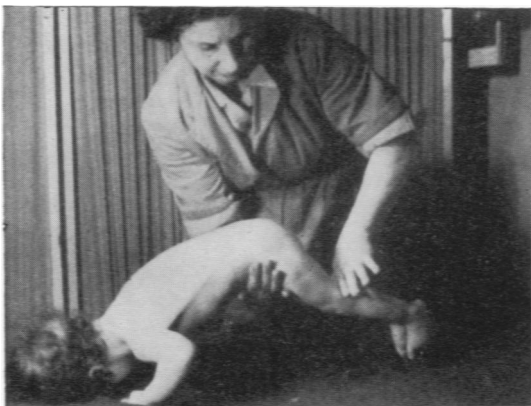
FIG. 5.—Resistance of the legs to passive flexion.

The 'Landau' Reflex. The examiner holds the child free in the air supported under the abdomen. A normal child, from the age of 6 to 8 months onwards, will lift the head and extend his spine and legs (this reaction has disappeared by the age of 3 years). If the examiner flexes the head passively the whole body will flex. The 'Landau' reflex is usually absent in the child with cerebral palsy. When held in the air, the child will neither raise his head nor extend his spine and hips. The knees, however, may be extended if extensor spasticity is marked. The absence of the 'Landau' reflex is due to the inhibiting influence of flexor spasticity on the