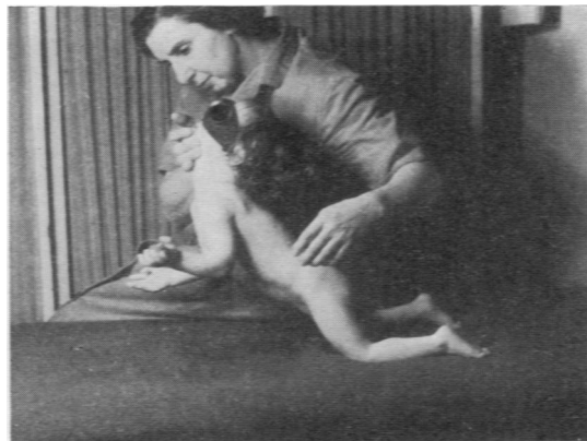
FIG. 4.—Absence of extension of the arms to support the weight of the body.