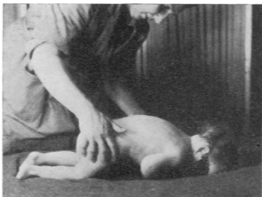
FIG. 3.—Absence of automatic turning of the head to the side in the prone position.

TESTING FOR FLEXOR SPASTICITY OF ARMS. The child with cerebral palsy when lying on the abdomen shows flexion and adduction of the arms, the hands placed under the chest. The examiner grasps the hands of the child and moves the arms upwards so that they lie extended at the side of the head. Note is taken of the resistance to this movement. On releasing the arms they will return to their initial flexed and adducted position.