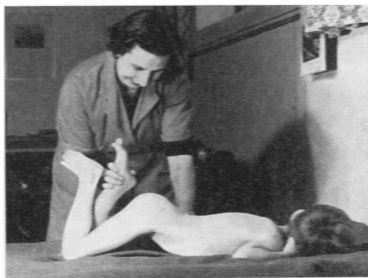
FIG. 6.—Flexion of the knees produces flexion of the hips.