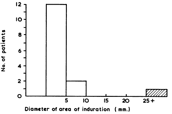
FIG. 2.—Double Mantoux: PPD-S (5 TU), tested retrospectively. Histogram, showing number of patients and diameter of area of induration.

These 15 children were later given double Mantoux tests, consisting of 5 TU of PPD-S and the equivalent dose of PPD-B injected in opposite forearms. In 13 the test was given between 1 and 5 years after the onset of the lymphadenitis, and in 2 the interval was shorter. The reactions produced by 5 TU of PPD-S are shown in Fig. 2. Most of the children showing weak reactions to the 100 TU of PPD-S failed to react to the smaller dose, but the child who developed the strong reaction to the large dose also reacted strongly to the small dose. In contrast, Fig. 3 shows the reactions produced by 5 TU of PPD-B. The children showing weak reactions to 100 TU of PPD-S reacted more strongly to the smaller dose of PPD-B, while the child (hatched columns in Fig. 1-3) who developed a strong reaction to the PPD-S extracts reacted less strongly to the PPD-B. We believe that this girl was infected by M. tuberculosis and that the other children were infected with anonymous mycobacteria.