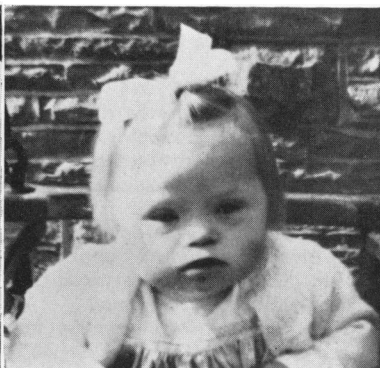
FIG. 2.—Patient, age 2 years 3 months.