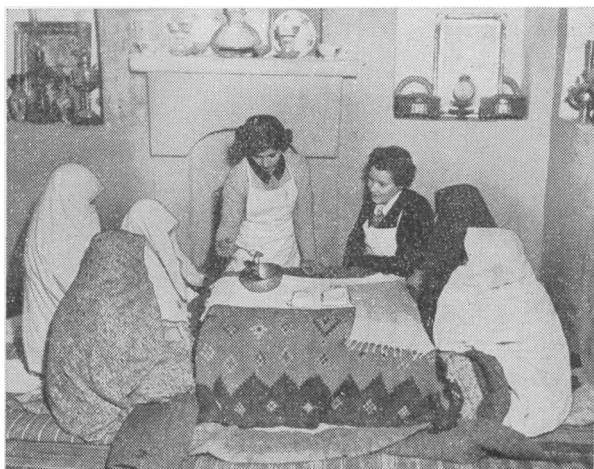
An Iranian nurse-midwife trainee, under the supervision of a United States public health nurse, is instructing village midwives in the proper method of sterilizing instruments.

All American health personnel in Iran are now assigned to functional positions in the cooperative, either in the central office or in one of the ostan offices, and the Ministry of