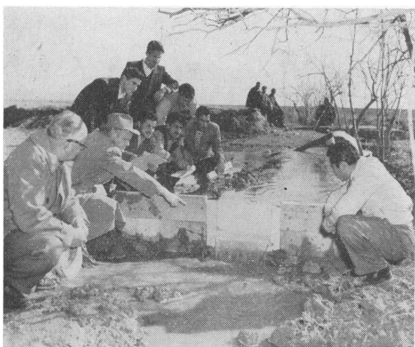
The use of a weir in measuring the volume of a stream is demonstrated to a sanitation class by Iranian and American instructors.

Operating out of these centers are small mo-