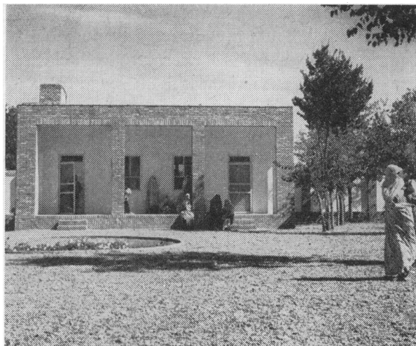
Women and children wait for the day's opening of the first health center the 4,000 inhabitants of Dastgerd, Iran, have ever known. It was built by the villagers with technical assistance provided by the United States Operations Mission to Iran and is staffed with Iranian medical technicians trained by the mission.

bile units, which go into the villages in the area to make surveys of special health problems, to handle epidemics or disasters, and to provide health services. Some 25 of these units, mounted on four-wheel-drive jeep truck chassis, have been constructed locally. In addition, three large mobile health units, equipped with good laboratories for making disease incidence studies, have been provided by the United States.