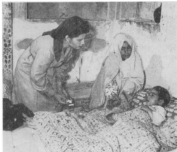
An Iranian health visitor from the village clinic staff treats a child who has measles complicated by pneumonia. The child did not die, as did most children in the years before when they suffered from this sequence of red spots followed by choking breath.

Health assigns personnel from its department of preventive medicine as mutually agreeable to the co-directors. Upon creation of the cooperative, all equipment, supplies, and facilities of the United States health mission and a considerable portion of those of the Ministry's department of preventive medicine were turned over to the organization, and specified sums of money from each country were consigned to the Iranian-United States joint fund. It was agreed that additional funds would be made available by both governments each year from June 30, 1953, through June 30, 1958. To augment these funds, the ostan cooperatives are encouraged to obtain contributions from local governments and organizations and from individuals.