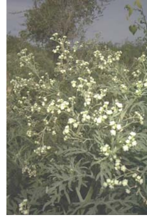
Parthenium hysterophorus L.