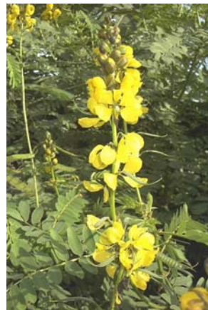
Senna didymobotrya Fresen