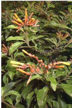
Hamelia patens Jacq