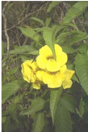
Tecoma stans L.