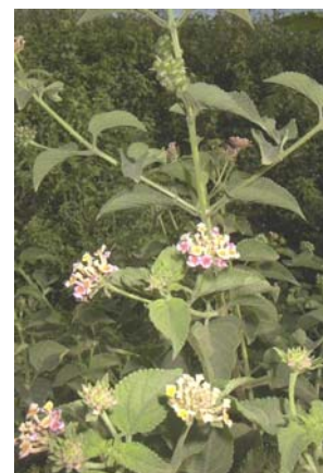
Lantana camara L.