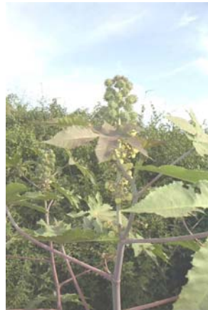
Ricinus communis L.