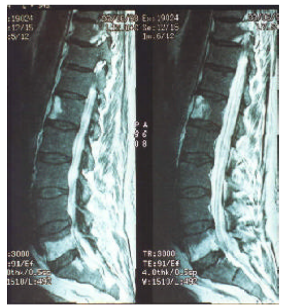
Fig. 4 MRI scan of lumbar spine revealing L1 and L5 vertebral body infiltration.

nerves, and the seventh and eighth cranial nerve complexes bilaterally. There was questionable enhancement of the optic chiasm, the ependymal surface of the lateral ventricles superolaterally and the descending portion of the left facial nerve. The lumbar spine images showed a generalised loss of signal intensity from the marrow of the vertebral bodies, suggesting lymphoma infiltration. Focal increased signal intensity of the L1 and L5 vertebral bodies suggested either focal fatty transformation or possibly haemangioma (Figure 4). There were also numerous small nodular densities in relation to the roots of the cauda equina (Figure 5). The findings were consistent with widespread leptomeningeal disease. The patient was treated with intrathecal Methotrexate as well as his ongoing Dexamethasone therapy and showed a marked