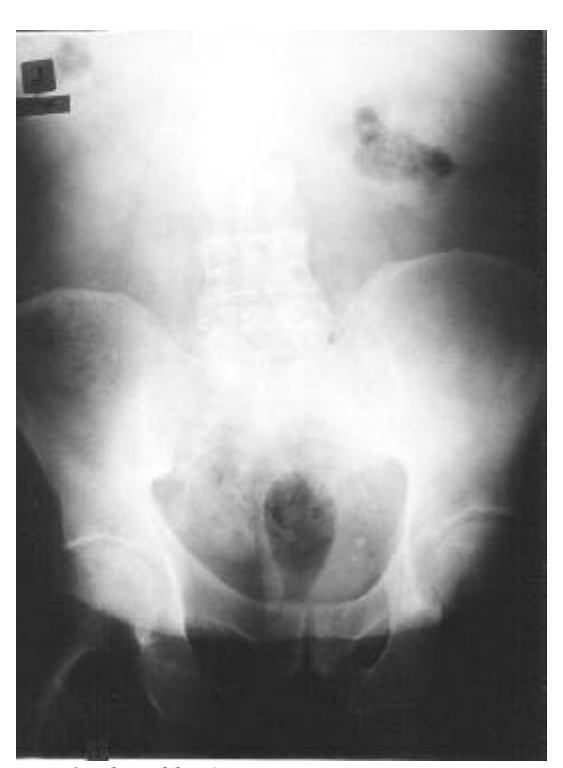
Fig. 1 Plain film Anteroposterior projection depicting a mild scoliosis.

In view of this patient's previous medical history and the insidious onset of his symptoms he was referred for a lumbar spine and pelvis plain film radiography. The x-ray examination revealed a mild scoliosis convex to the left with some early anterior osteophytic lipping to the L2/3 vertebral body, but no focal bone destructive lesion was