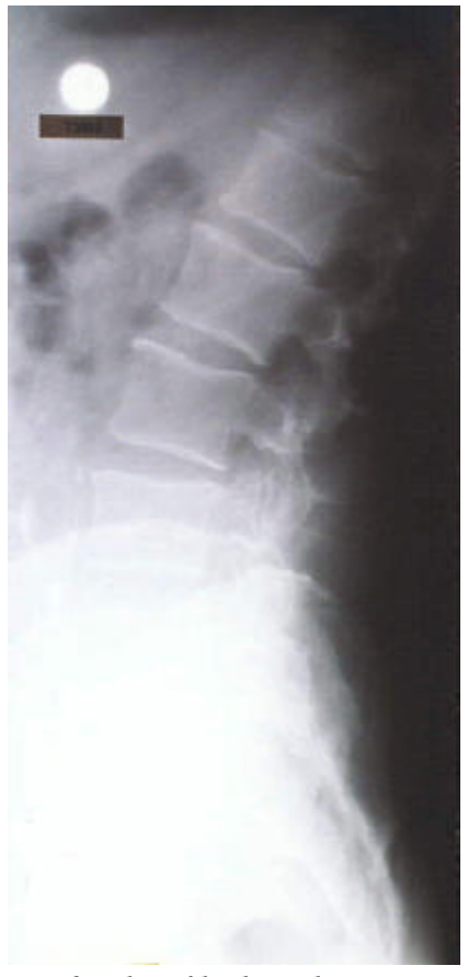
Fig. 2 Plain film lateral projection depicting anterior osteophytic lipping.

evident (Figures 1,2). A further treatment three days later provided substantial relief of this man's low back and leg pain.