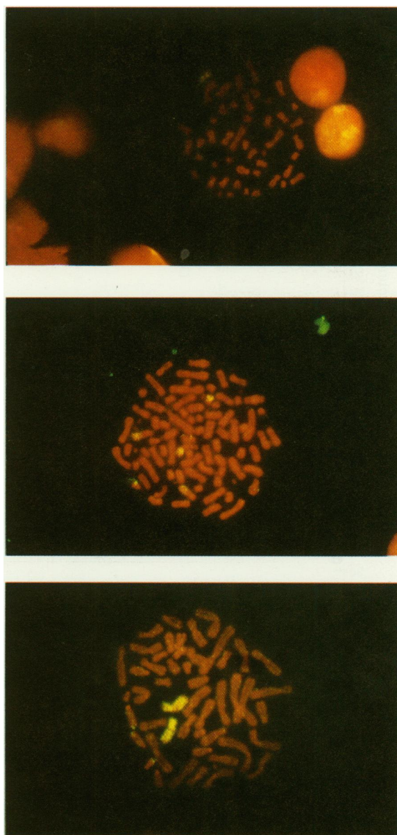
Figure 1 Fluorescence in situ hybridisation on metaphase chromosomes using human total genomic biotin-labelled painting probes of chromosome 10 on three xenografted gliomas. (a) Specific painting of TG-15-HA xenograft, a diploid clone, revealed only one chromosome 10. (b) Specific painting of euploid TG-18-CH xenograft detected two chromosomes 10. (c) Specific painting of TG-23-GI xenograft showed a rearrangement of chromosome 10.

of GAPDH, used as an internal marker. To ensure that mRNA quantification could be performed under our experimental conditions, increasing concentrations (2.5–20 \mu\text{g} ) of TG-8-OZ extract were electrophoresed, then blotted, hybridised with the [ 32 P]HK-I probe and the radioactive signal measured by a phosphorimager. A linear correlation was obtained between the area under the curve and the amount of HK-I mRNA ( \alpha < 0.01 , data not shown). The individual HK-I mRNA amount in the 12 gliomas tested ranged from 0.78 to 0.28 AU, whereas HK-I mRNA expression in a normal human brain extract was 1.2. HK-I mRNA was considered as decreased when below 0.6, i.e. less than 50% of the control. Compared with normal human brain, the HK-I mRNA transcript level was drastically decreased in seven gliomas and somewhat less in the five others. The two gliomas that retained their chromosomes 10 (TG-18-CH and TG-8-OZ) had more transcripts (0.78 and