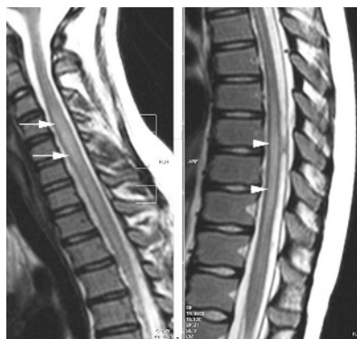
Figure 1 Sagittal T 2 weighted MRI of the spinal cord, showing a central high signal intensity extending with its maximum at the level of the lower cervical (arrows) and thoracic (arrowheads) spine.

In neuroborreliosis, back pain results from meningoradiculoneuritis (Garin-Bujadoux-Bannwarth syndrome) and myelitis. 1 Lyme myelitis involves the white matter, resulting in paralysis. Nevertheless, in our patient Lyme borreliosis manifested as nonparalytic