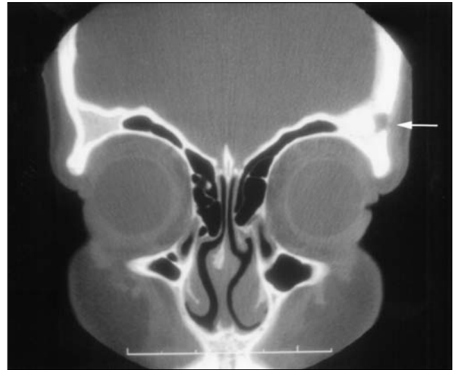
Figure 3) Coronal computed tomography scan showing a lytic lesion in the lateral aspect of the left supraorbital region (arrow)

At The Hospital for Sick Children, Toronto, Ontario, an x-ray of the left ankle showed a 1 cm lytic lesion in the talus with no periosteal reaction, as well as a joint effusion in the left ankle (Figure 1). Magnetic resonance imaging revealed extensive osteomyelitis of the talus, navicular and tibia. A sinus tract extended into the skin from the lesion in the talus (Figure 2). Synovial fluid and biopsies of the bone and synovium were negative by Gram, acid fast and calcofluor stains, but on culture they yielded a white, fluffy filamentous fungus identified as Blastomyces dermatitidis . The patient recalled having had a painful, firm swelling at the