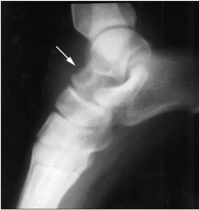
Figure 1) Radiograph of the left foot and ankle showing a sclerotic lesion in the anterior talus (arrow)