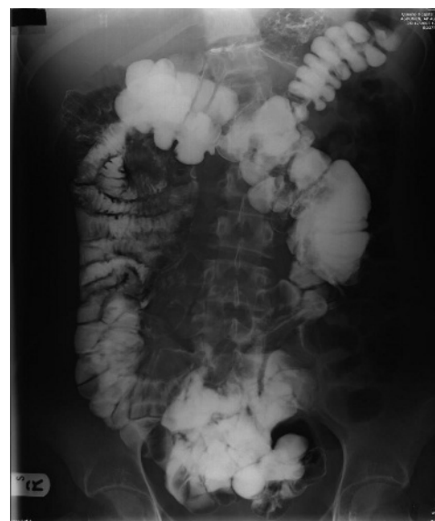
Figure 1 Barium meal.